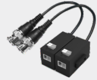
PFM800-E Passive HD-over-Coax Balun