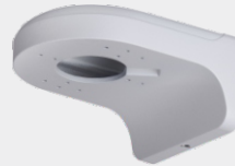
PFB204W Wall Mount