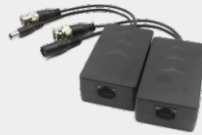
PFM801-4MP Passive HD-over-Coax Balun with Power